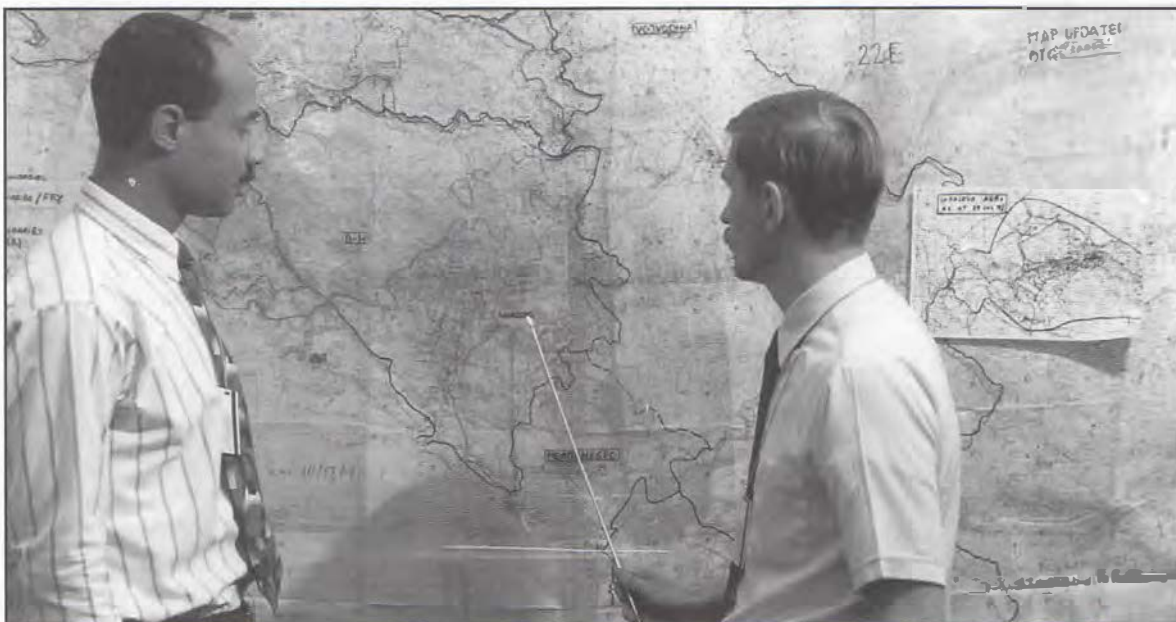
Duty officers in the UN Department of Peace-Keeping Operations's situation room — a destination for orientation sessions for parliamentarians in 1997.

In 1996, the strength of Global Action's new relationship with the Department of Peace-keeping Operations will be demonstrated through its Orientation Program on UN Peacekeeping at the department's headquarters in New York. This program serves as part of the follow-up on the Congressional Workshop. The Orientation Program on UN Peacekeeping is designed to provide parliamentarians with a first-hand look at the Department of Peace-keeping Operations. The program will include presentations by the officers and civilian staff engaged in policy and analysis; operations plans, and training; and field administration and logistics. The initial Orientation Program will include Members of the U.S. Congress and Canadian Parliament and will serve as a test-bed for further orientation sessions.