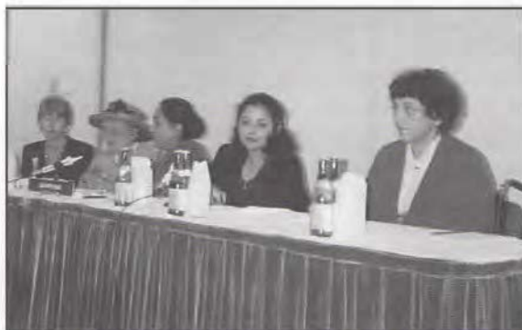
The Beijing workshop on women in politics. From left to right:

During the conference, Global Action members intensely debated the "The Uncompromised Beijing Declaration: From Paper