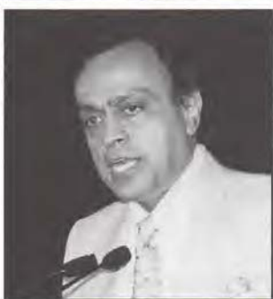
Mr. Murli Deora became International President of Parliamentarians for Global Action in 1995 (page 28). Mr. Deora was elected mayor of Bombay by the largest majority ever recorded; he was also the youngest mayor ever. He entered the Lok Sabha in 1984 and serves on its Finance Committee. He is President of the Bombay Regional Committee of the ruling Congress Party.

1995 provided a host of round-number anniversaries. Foremost was the 50th anniversary of the United Nations. Hopes were high that the 50th would bring major reform of the UN System. Unfortunately, hopes that rely on numbers are rarely realized.