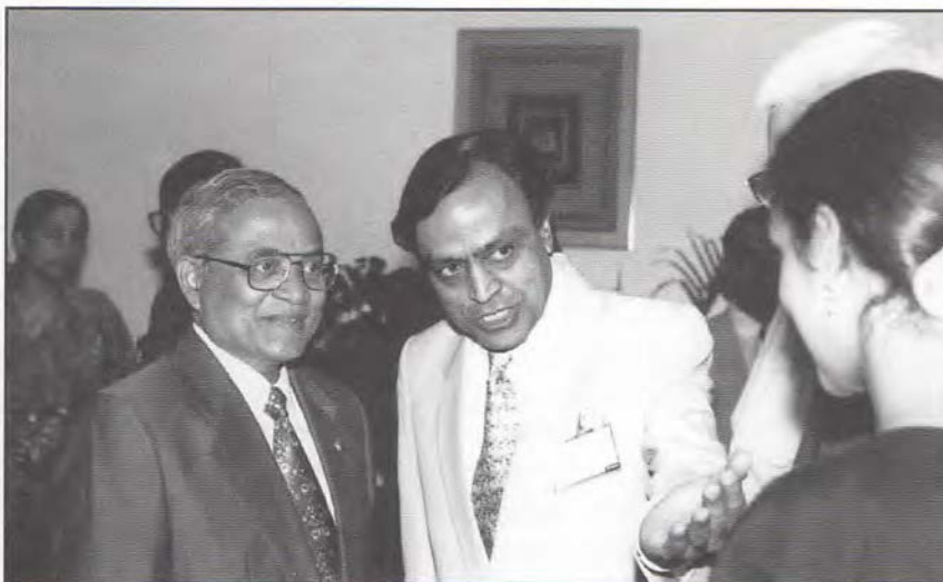
At a reception, PGA International President Mr. Murli Deora (MP, India) introduces workshop participants to the President of the Republic of the Maldives, H.E. Mr. Maumoon Abdul Gayoom.

Reviewing the workshop during the last session, all of the participants found that the experience had been rewarding and useful. Many felt that the concepts learned could be applied to work which they were doing both within their countries and in the region. All of the parti-